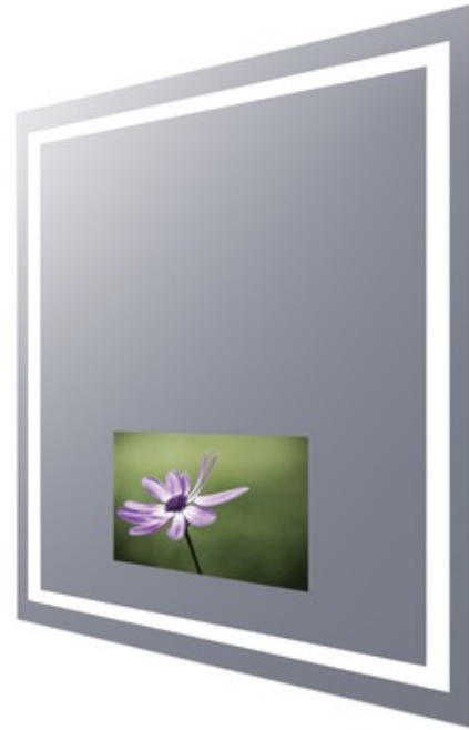
Shown in: Mirror

The Integrity Lighted Mirror with TV is designed to maximize direct illumination. Ideal for precision tasks such as makeup application and shaving. White powder coated chassis for finished side view. Corrosion-resistant OmegaMirror with Spectrum mirror glass technology. 15.6 or 21.4 inch LED HDTV with HDMI, RF and component connections. Integrated speakers for high quality stereo sound. Electric Mirror's Spectrum Mirror TVs are best suited for bathrooms that are not overly bright. When the TV is off, the screen area is camouflaged, leaving only a light gray image where the TV is located. Waterproof remote included. Note: The Integrity TV mirror must be installed in the W x H (width x height) orientation as listed; it cannot be installed in any other direction.