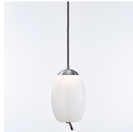
Shown in brushed stainless steel / transparent opaline

LAMP COLOR . . . . . 2700K LUMENS/WATT . . . . . 62.50 LUMINOUS FLUX . . . . . 250 lumens