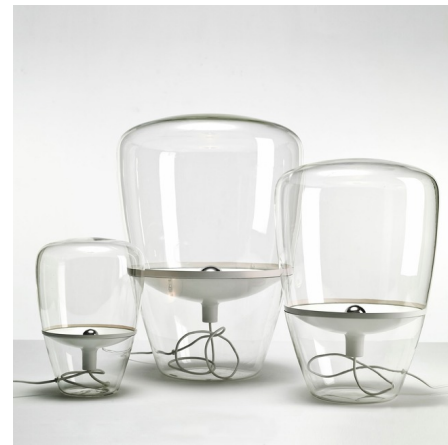
Shown in white / glossy clear

Balloons Lamp evokes images of hot air balloons and captivates with the beauty of hand-blown glass and an elegant metal reflector hovering within. Available in three sizes. The size of the largest shade pushes the boundaries of glassblowing technology and illustrates the exceptional skill and craftsmanship of Bohemian glass-makers. Balloons also makes an outstanding sculptural statement when switched off. On/off switch on cord. Glass shade available in Glossy Clear, Smoke Grey, or Smoke Brown. Reflector available in Black, Brass, Copper, Chrome, Chrome Black, Lemon Yellow, Reflective Orange, or White. All fixtures include a Black textile cable except White which includes a White textile cable.