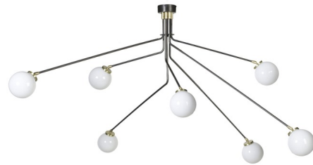
Shown in bronze / satin brass

The Array Opal Pendant draws inspiration from 1960's era Italian design, featuring a familiar, yet distinctly modern form with rotating arms and hand-blown Opal glass shades allowing the fixture to be positioned to suit your individual desires. Available in hand waxed Bronze with Satin Brass or Bronze accents. CE and cUL listed. Made in England. Note: The minimum overall drop length from the ceiling to the bottom of the fixture is 31.5 inches. Exact overall drop length is specified to order and not field adjustable.