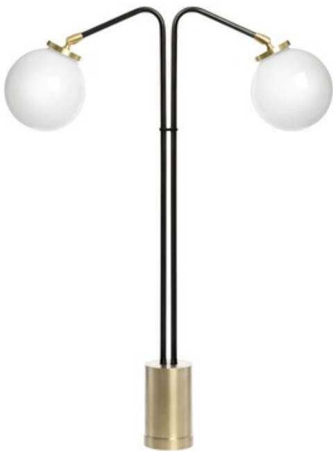
Shown in: Satin Brass / Opal

The Array Twin Opal Table Lamp draws inspiration from 1960's era Italian design, featuring a familiar, yet distinctly modern form with a slender body finished in hand waxed Bronze set into a cylindrical Satin Brass base with two hand blown Opal glass diffusers. Inline on/off switch. CE and cUL listed. Made in England.