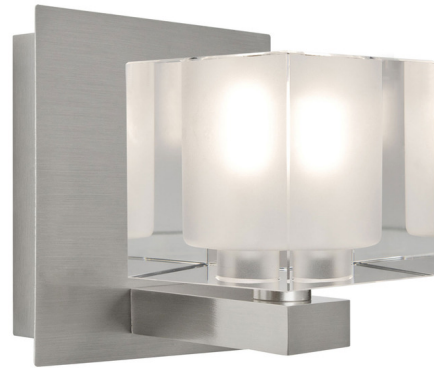
Shown in satin nickel / clear / frost

The Bolo Wall Light features an appealing cube-shaped clear machined crystal, accented by an interesting inner frosting to diffuse the light source. The splash of concealed illumination through the solid Crystal makes the Bolo a stunning display of light refractions. Each cube is cantilevered from the plated Satin Nickel backplate on a die cast fitter.