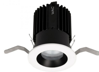
Shown in white / black reflector