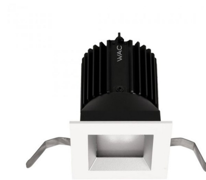
Shown in white / haze reflector