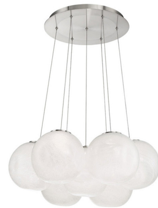
Shown in brushed nickel / marble

LAMP LIFE . . . . . 60000 hours COLOR RENDERING . . . . . 90 CRI LAMP COLOR . . . . . 3000K LUMENS/WATT . . . . . 414.14 LUMINOUS FLUX . . . . . 2899 lumens