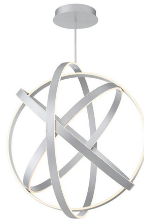
Shown in titanium

LAMP LIFE 84000 hours COLOR RENDERING 80 CRI LAMP COLOR 3500K LUMENS/WATT 22.59 LUMINOUS FLUX 2937 lumens