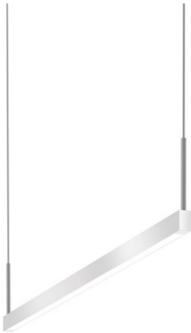
Shown in: Bright Satin Aluminum / White Acrylic

The Thin-Line Pendant is sleek and minimal in form, embodying geometric architectural style and integrating beautifully into modern spaces. Made of aluminum and an optical acrylic diffuser, it is both stylish and functional. Use it to illuminate a range of settings including dining and kitchen areas, offices, and commercial interiors. Two configurations are available: One-Sided: directs light in a single direction, can be installed as an uplight or downlight. Two-Sided: directs light both up and down. Notes: The included LED driver must be installed in a remote accessible location near the fixture. 2700K and 3500K color temperatures are only available for: 48 inch Satin Black, Satin White, Bright Satin Aluminum 72 inch Satin Black, Satin White