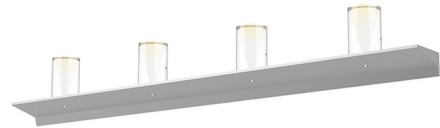
Shown in bright satin aluminum / large laser-etched crystal

Votives Laser-Etched Crystal 48 Inch Wall Bar features a linear arrangement of LED lights set in a wall-mounted plinth that evoke the sensation of candlelight through a cylindrical laser-etched crystal glass diffuser, with an additional light source beneath each votive to cast a cone of illumination on the wall above and below. TRIAC and ELV dimming. Note: Includes driver which needs to be installed in an accessible nearby location.