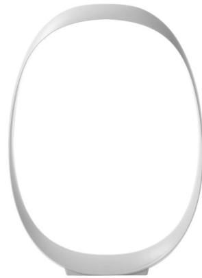
Shown in white / white

The Anisha LED Table Lamp is an irregular ellipse that gives a sense of becoming. Anisha outlines an empty space, defines it and fills it with its light, producing a magical sensation. The touch dimmer switch is inserted at the base of the diffuser.