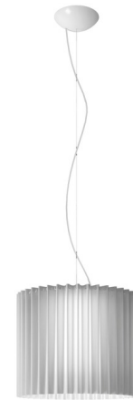
Shown in white / white

COLOR RENDERING . . . . . 80 CRI LAMP COLOR . . . . . 2700K LUMENS/WATT . . . . . 123.08 LUMINOUS FLUX . . . . . 1600 lumens