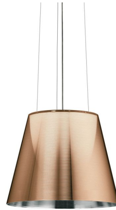
Shown in stainless steel / aluminized bronze

The KTribe S2 Pendant features an inner white polycarbonate diffuser with white opal finish and outer diffuser in PMMA (polymethyl methacrylate) with silver on the inner surface applied by vacuum aluminum coating. Features three stainless steel cables and a white ceiling rose. One 150 watt, 120 volt, T10 medium base halogen bulb is included. UL listed.