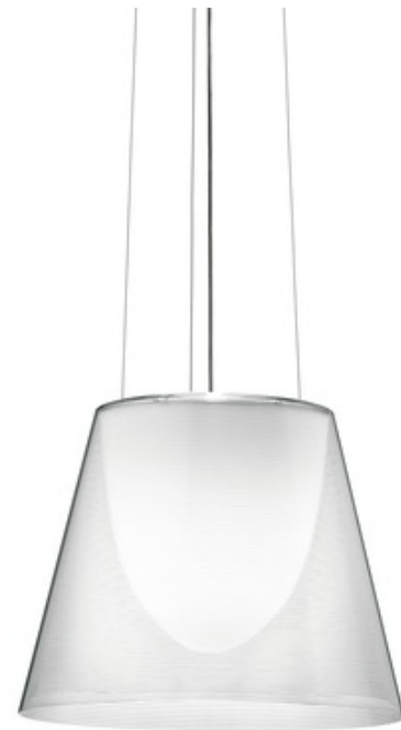
Shown in: Stainless Steel / Transparent

The KTribe S2 Pendant features an inner white polycarbonate diffuser with white opal finish and outer diffuser in PMMA (polymethyl methacrylate) with silver on the inner surface applied by vacuum aluminum coating. Features three stainless steel cables and a white ceiling rose. One 150 watt, 120 volt, T10 medium base halogen bulb is included. UL listed.