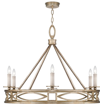
Shown in soft gold

Named for the seaside city on the southern coast of Cuba that is considered the Pearl of the South, the Cienfuegos Ring Chandelier draws inspiration from the city's architectural transitions of the 1920s and embodies the combination of old and new. It features a metal frame supporting a candle holder in Antique Bronze, Soft Gold, Gold Leaf, or Weathered Greige Patina with or without Natural Greige fabric diffuser shades or Silver Leaf with or without White fabric diffuser shades. Canopy: 5.5 inch diameter. Suitable for vaulted ceilings. Made in the USA. UL listed.