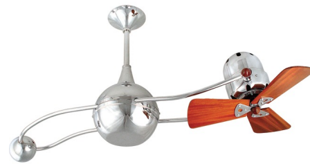
Shown in polished chrome / mahogany tone