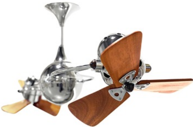
Shown in: Polished Chrome / Mahogany

The Matthews-Gerbar Italo Ventania Wood Ceiling Fan is the largest ceiling fan in the Matthews Fan Co collection. Its vortex sculpted arms grasp also remarkable, side-mounted blades in gentle, equatorial rotation. The fan head can be infinitely positioned in 180 degree arcs for optimum air movement. The greater the angles of the motors to the horizontal support rods, up or down, the faster the axial rotation. A slow, controlled axial rotation is achieved by both fan head position and fan blade speed. The 360 degree rotation can circulate heat and air condition more effectively that traditional fansAvailable in a variety of finishes with solid, ecologically harvested Brazilian Mahogany blades. Features a 19 degree blade pitch and 16 inch diameter per head. Includes a flat ceiling canopy, one 10 inch downrod, and a 3 speed Decora-style wall control in White. UL and cUL listed. Limited lifetime warranty. Additional downrod lengths and vaulted ceiling canopy sold separately.