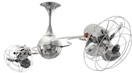
Shown in polished chrome