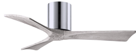
Shown in polished chrome / barn wood tone

The Atlas Irene Hugger Ceiling Fan is rustic yet strikingly modern, with cleanly joined solid wood blades and a minimal cylindrical motor housing. Its streamlined profile with the warm, natural look of wood works beautifully in contemporary and transitional spaces. Equipped with a DC motor, the fan is energy efficient and ultra-quiet. A hand-held remote control and wall control are included, both able to turn the motor on/off and set 6 speeds and forward/reverse. For fans that have a light, the controls also turn the light on/off and dims it. Fans that have a light include a cap matching the housing finish for no-light use. Note: Some combinations of motor finish, blade color, and light option are not available. The 72 inch is available in a 3-blade only and is not available with a light option.