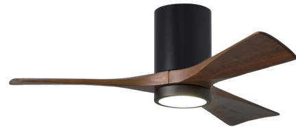
Shown in matte black / walnut tone

LAMP LIFE . . . . . 60000 hours COLOR RENDERING . . . . . 90 CRI LAMP COLOR . . . . . 3075K LUMENS/WATT . . . . . 43.13 LUMINOUS FLUX . . . . . 690 lumens