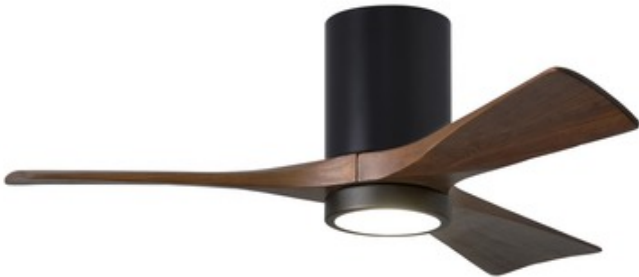
Shown in: Matte Black / Walnut

The Atlas Irene Hugger Ceiling Fan is rustic yet strikingly modern, with cleanly joined solid wood blades and a minimal cylindrical motor housing. Its streamlined profile with the warm, natural look of wood works beautifully in contemporary and transitional spaces. Equipped with a DC motor, the fan is energy efficient and ultra-quiet. A hand-held remote control and wall control are included, both able to turn the motor on/off and set 6 speeds and forward/reverse. For fans that have a light, the controls also turn the light on/off and dims it. Fans that have a light include a cap matching the housing finish for no-light use. Note: Some combinations of motor finish, blade color, and light option are not available.