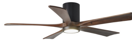
Shown in matte black / walnut tone

LAMP LIFE . . . . . 60000 hours COLOR RENDERING . . . . . 90 CRI LAMP COLOR . . . . . 3075K LUMENS/WATT . . . . . 43.13 LUMINOUS FLUX . . . . . 690 lumens