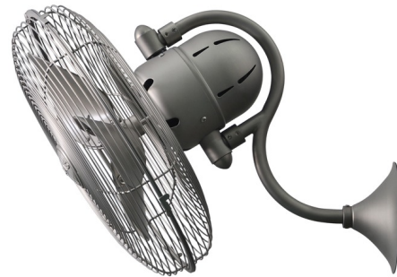
Shown in brushed nickel

The Atlas Fan/Laura Wall Fan is compact and powerful. The whisper quiet 3 speed DC motor oscillates left to right 90 degrees, providing air to the whole room. Features a 15 inch blade span with a 31 degree pitch. Includes a 3 speed RF hand held remote control in Black. UL listed. Damp location rated for use in covered porches, patios and sunrooms. Limited lifetime motor warranty.