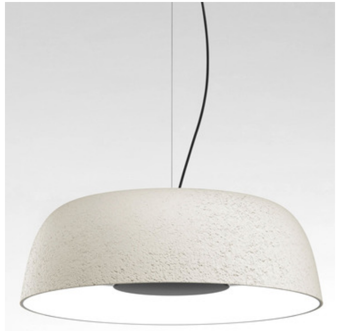
Shown in: Black / White

The Djembe Pendant is like the echo of a drum, designed for repetition creating a musical composition of light. The shade is made of bi-injected rotary molded polyethylene that is textured to resemble stone. The inside is a smooth satin white, perfect for the reflection of light from the lacquered grey diffuser inside. Dimmer Compatibility Notes: All size options can be dimmed with low-voltage electronic dimming. The 25x9, 25x14, 26x17, and 39x15 inch size options are all equipped with a dual dimming driver and can be dimmed via low-voltage electronic or 0-10V dimming.