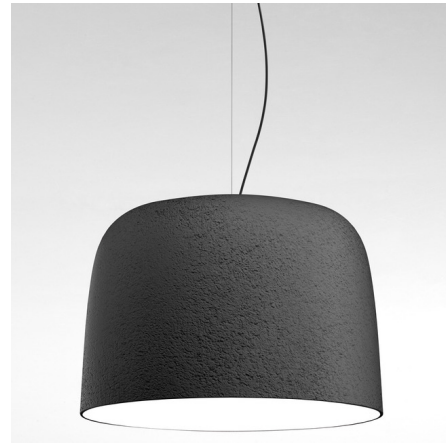
Shown in black / white

LAMP COLOR . . . . . 2700K LUMENS/WATT . . . . . 145.34 LUMINOUS FLUX . . . . . 3023 lumens