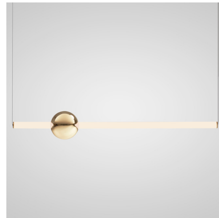
Shown in polished gold / opal

PRODUCT DIMENSIONS Max Overall Height: 196 7/8" LAMP COLOR 2700K LUMENS/WATT 63.63 LUMINOUS FLUX 1069 lumens