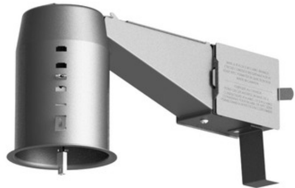
Shown in: Galvanized Steel

The Urbai 3.5 Inch 120 Volt Remodel Housing is available in a Performance 1 and Performance 2 option. Performance 1 (IC - 10 watts/up to 1018 lumens) or Performance 2 (Non-IC - 15 watts/up to 1326 lumens). IC designation allows for insulation to be in direct contact with housing. Non-IC designation requires that insulation be kept a minimum of 3 inches away from housing. Cutout diameter: 3.75 inch. Can fit ceilings up to 1.25 inch thick. Requires a 7 inch clearance beyond the ceiling level. UL listed for damp locations. Wet location listed with shower trim options only. JA8 listed with specific trims in Performance 1 only. Dimmable with a 0-10V dimmer (see attached manufacturer reference for dimmer compatibility). A complete fixture includes a housing and trim, sold separately.