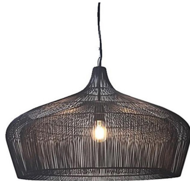
Shown in black / black

Moire Factory Pendant is handmade in the Philippines from galvanized iron, a malleable material which allows artisans to weave this innovative shape. Finished in Black. Comes with 10 feet of field adjustable cable to customize length. UL listed.