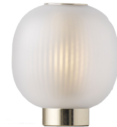
Shown in nickel / white

LAMP LIFE . . . . . 15000 hours COLOR RENDERING . . . . . 90 CRI LAMP COLOR . . . . . 3000K LUMENS/WATT . . . . . 94.00 LUMINOUS FLUX . . . . . 470 lumens