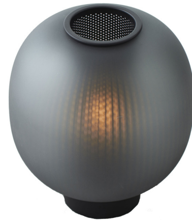
Shown in nickel / textured black

LAMP LIFE . . . . . 15000 hours COLOR RENDERING . . . . . 90 CRI LAMP COLOR . . . . . 3000K LUMENS/WATT . . . . . 11.75 LUMINOUS FLUX . . . . . 470 lumens