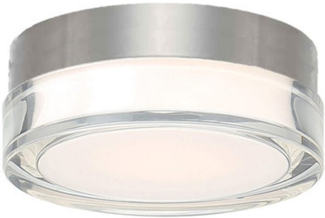
Shown in: Stainless Steel / White

The weather-resistant Pi 120V Outdoor Wall / Ceiling Light handles outdoor elements with ease, and its refined industrial style makes it just as suitable for indoor applications. Its durable body is made of either aluminum finished in a black powder coat or 316 marine grade stainless steel, and it offers task and ambient lighting dispersed through a lightweight injection-molded acrylic diffuser. Installation is a snap with the user-friendly twist lock mechanism. This light uses AC LED driverless technology and is dimmable with an ELV dimmer, sold separately.