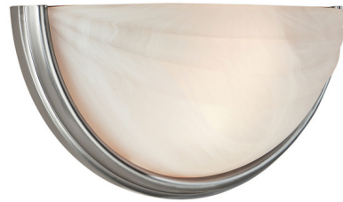
Shown in satin / alabaster

COLOR RENDERING . . . . . 90 CRI LAMP COLOR . . . . . 3000K LUMENS/WATT . . . . . 160.00 LUMINOUS FLUX . . . . . 1600 lumens