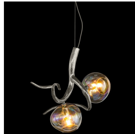
Shown in nickel / iridescent

The Ersa Element Pendant, named for the Greek Goddess of dew, draws inspiration from nature's dew drops formed throughout the night and glistening in the first rays of light. This sculptural masterpiece brings organic shaped glass and sinewy branches of metal to your space. Each fixture is a unique, hand crafted piece, and comes with a certificate of authenticity. Note: The 2-Light pendant is not available with Bronze and Matte White finishes. The 3-Light pendant is not available with Matte Black and Matte White finishes. Includes canopy cover for US junction box.