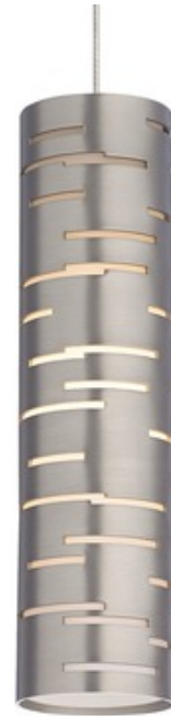
Shown in: Satin Nickel / Satin Nickel

Revel Freejack Pendant captures light in motion with a sleek laser-cut metal surface allowing light to shine through the inner white case glass diffuser. Compatible for use with 1-circuit and 2-circuit Monorail track systems or Freejack canopy. Halogen: Includes one 12 volt, 50 watt JC GY6.35 halogen bi-pin lamp. LED: Includes one 12 volt, 8 watt replaceable SORAA LED module. Supplied with six feet of field-cutttable suspension cable and a Freejack connector. Freejack canopy required if used as a monopoint, sold separately. LED canopy compatible with both halogen and LED lamp options. Dimmer type dependent on system transformer (low voltage magnetic or electronic).