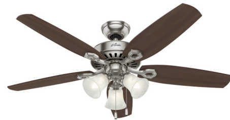
Shown in brushed nickel / cherry / mahogany