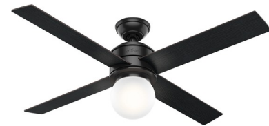
Shown in matte black / white