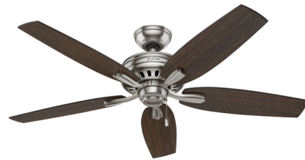
Shown in brushed nickel / medium walnut / dark walnut

The Newsome Ceiling Fan offers a simple, classic look that works well in many interior spaces, and its reversible blades allow you to customize the look to suit your tastes. Equipped with a 3-speed WhisperWind motor, it quietly delivers refreshing airflow to create a comfortable environment. Pull chains are included for turning the fan on/off, adjusting speed, and turning the light on/off. Fan direction can be reversed using a switch on the fan. Optional accessories are sold separately.