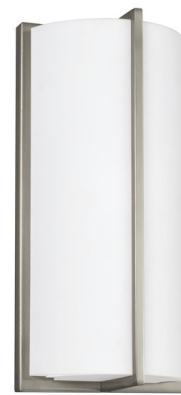
Shown in brushed nickel / satin white

LAMP LIFE . . . . . 50000 hours COLOR RENDERING . . . . . 90 CRI LAMP COLOR . . . . . 3000K LUMENS/WATT . . . . . 71.43 LUMINOUS FLUX . . . . . 1000 lumens