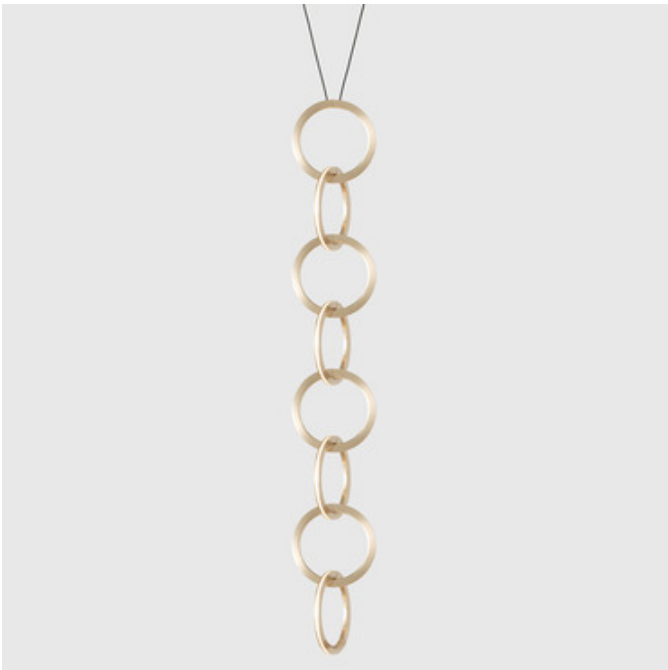
Shown in: Brass

The Circus 250 Pendant, designed by Resident Studio, is a remarkable, theatrical and truly flexible system of interconnected rings. Each ring projects an elegantly diffused warm LED light source outwards around a 360 degree plane. This revolutionary piece is available with two through eleven rings. A matte black canopy is included for both the Brass and Black finishes. Includes a 24V DC driver, dimmable with a 0-10V dimmer.