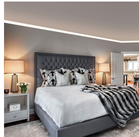
Shown in aluminum

LAMP LIFE . . . . . 50000 hours COLOR RENDERING . . . . . 92 CRI LAMP COLOR . . . . . 2700K Warm Dim LUMENS/WATT . . . . . 744.00 LUMINOUS FLUX . . . . . 3720 lumens