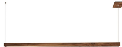
Shown in wood walnut / no louver

LAMP LIFE . . . . . 50000 hours COLOR RENDERING . . . . . 92 CRI LAMP COLOR . . . . . 2700K Warm Dim LUMENS/WATT . . . . . 170.70 LUMINOUS FLUX . . . . . 1707 lumens