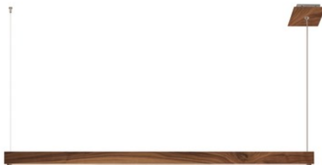
Shown in: Wood Walnut / No Louver

Glide Wood Up/Down End Feed Suspension is a linear LED fixture that offers direct and indirect light in a clean, contemporary style. Available with one or two canopies. Downlight features a diffused white lens with 100 degree beam spread and optional black or white louvers for adjustability. Uplight features a clear frosted 60 degree lens. Available in seven color temperature options. Channel widths sold in 12 inch increments from 36 to 120 inches with 7 (2 watts up/5 watts down), 10 (5 watts up/5 watts down), or 12 watts (5 watts up/7.5 watts down) per foot. Supplied with 12 feet of adjustable coaxial cables (fixtures exceeding 96 inch include additional aircraft cables). 120 volt input, 24VDC Class 2 output, electronic low voltage LED power supply included in canopy. Dimmable with an electronic low voltage dimmer: (Lutron Diva DVELV-300P, Lutron Skylark SELV-300P, Lutron Maestro MAELV-600 and Lutron Radio Ra 2, or Legrand Adorne ADTP703TU), sold separately. Uplight and downlight can be individually dimmed using two electronic low voltage dimmers. 5 year warranty. Product is built to order.