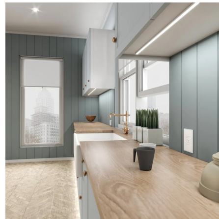
Shown in satin aluminum / clear lens

LAMP LIFE . . . . . 50000 hours COLOR RENDERING . . . . . 90 CRI LAMP COLOR . . . . . 2000K-4000K Tunable White LUMENS/WATT . . . . . 46.20 LUMINOUS FLUX . . . . . 231 lumens