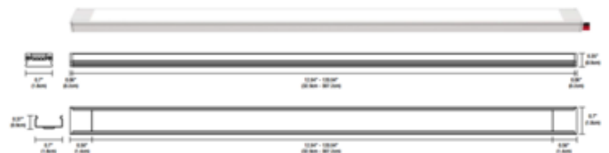
Included Components: Indoor Light Channel .3 Surface Mount system overview