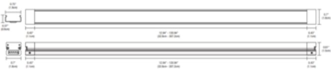
Included Components: Light Channel .6 Surface Mount system overview