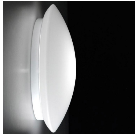
Shown in white / satin opal

The Bis Wall/Ceiling Mount brings a clean simple look to your interior space. Features a hand blown triplex satin Opal glass with a White varnished metal finish. Two smallest sizes are ADA compliant when used on the wall.