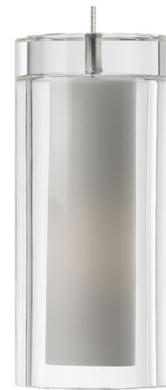
Shown in satin nickel / clear

Sara Freejack Pendant features a crisp, pressed glass shade with a hand-blown inner white glass diffuser. Compatible for use with 1-circuit track system or Freejack canopy. Includes six feet of field-cuttable suspension cable and a Freejack connector. Freejack canopy required if used as a monopoint, sold separately. LED canopy compatible with both halogen and LED lamp options. Dimmer type dependent on system transformer (low voltage magnetic or electronic). ETL listed. Title 20 compliant.