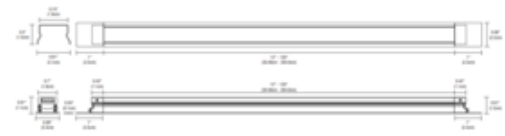
Light Options and Lamp Data for Indoor Light Channel .6" Recessed Millwork