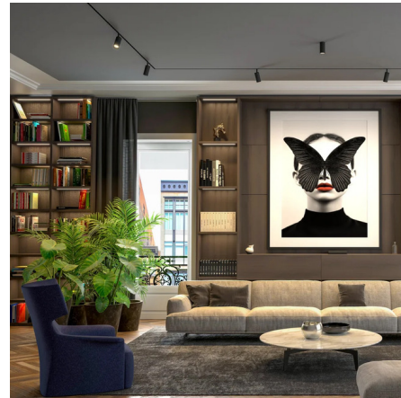
Shown in satin aluminum / diffused lens