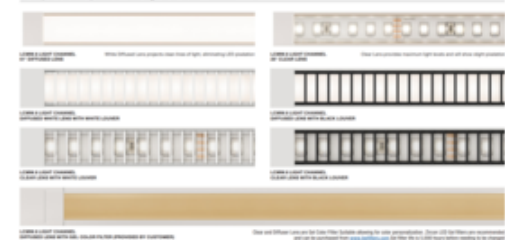
COMPONENTS Light Channel .6" Millwork System Overview