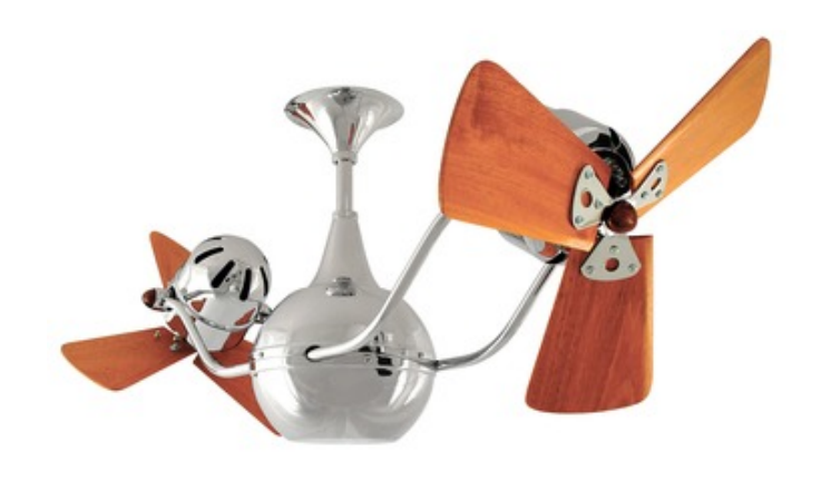
Shown in: Chrome / Mahogany